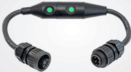
Break Away Connector