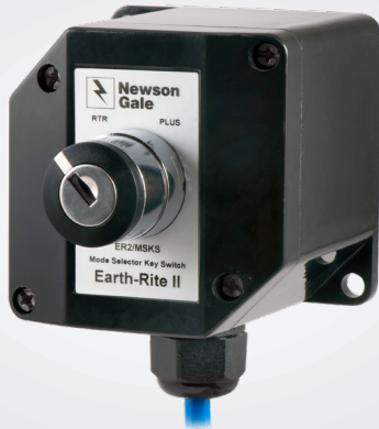
Mode Selector Key Switch